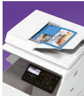
Full colour network scanning