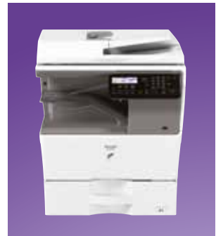
Desk top configuration